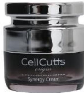
Cellcutis Signature Cream 50ml

Frozen dry cells containing plant stem cells (1,000 ppm) When used in combination with Synergy ampoule, dark and dull skin became clear and moist. This cell help the skin restore skin balance and vitality