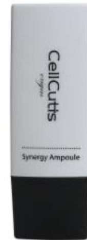
Cellcutis Synergy Ampoule 50ml

Plant stem cells (1,000 ppm) Cream contain also lotus callus culture extract, macadamia seed oil, and ceramides to nourish and moisturize rough and vigorous skin for a firm and moist skin